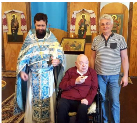
Poet Naum Korzhavin in the middle