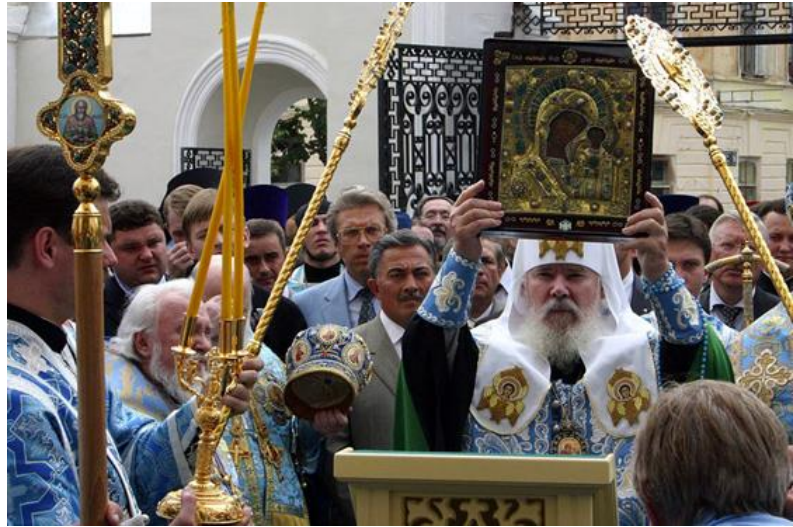
On June 21, 2005, the year of the 450th anniversary of the founding of the Kazan diocese, the Holy Patriarch of Moscow and All Russia Alexey II, at the end of the Divine liturgy in the Cathedral of the Kazan Kremlin, handed over to believers a great shrine - the Kazan icon of the 18th century, which was in the chambers of Pope John Paul II.

https://azbyka.ru/video/svyatoe-znamenie-rossii-kazanskaya-ikona-bozhiej-materi/#