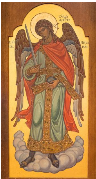
Icon of Archangel Michael on the South (right) door in the iconostasis in our Holy Trinity Church

The celebration of the Council of the Archangel of God, Michael, was established at the beginning of the 4th century at the Laodicean Council, several years before the First Ecumenical Council. The Council of Laodicea, by Canon 35, condemned and rejected the heretical worship of Angels as creators and rulers of the world but approved of their veneration.