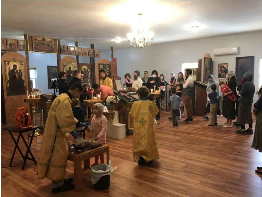
Our Holy Trinity Church, October 2020.