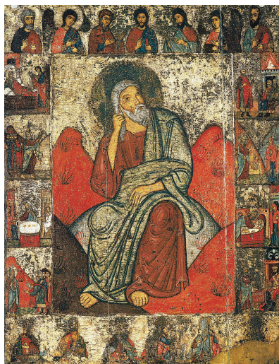
Prophet Elijah, 12th century, Pskov school. Tretyakov Gallery, Moscow

Ilyin's day (August 2, July 20, according to the old style) is a church day in memory of the prophet Elijah and a traditional folk festival for many peoples who converted to Orthodoxy. The story of the prophet Elijah, who belonged to the most revered saints, along with Nicholas the Wonderworker, is told in the pages of the Old Testament. These ancient book traditions served as the genesis of Slavic folk legends about Ilya, who sat at home until the age of 33, was healed, endowed with tremendous power and then taken alive. In Russia, the cult of Elijah originated before the adoption of Christianity, and with baptism only strengthened. Orthodox Christians of all times, and in all places, have venerated the Prophet Elijah for centuries. The first church in Russia, built at Kiev under Prince Igor, was named for the Prophet Elijah. After her Baptism Saint Olga (July 11) built a temple of the holy Prophet Elijah in her native region, at the village of Vibuta. By