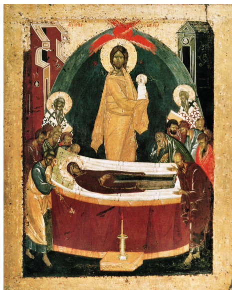
Theophanes the Greek (1392), Tretiakov Gallery

St. Theophan Zatvornik (the Recluse), 1815-1894. Sermon on the Dormition of the Most Holy Theotokos: