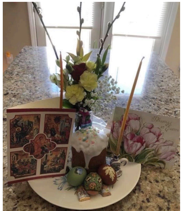
Our parishioner, who is in complete isolation, published this photo on her Facebook page with words of gratitude to the sisters of our parish for their care and love.