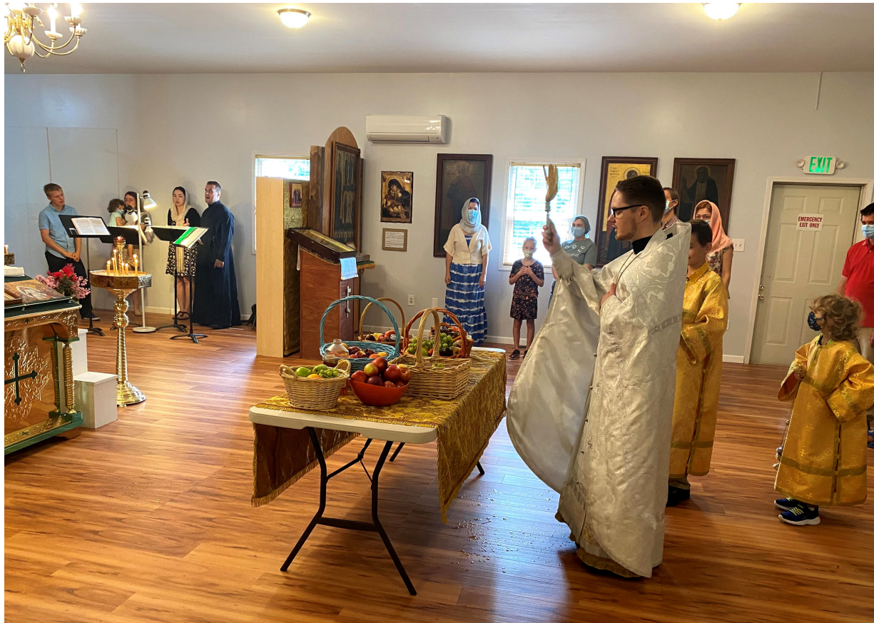
Consecration of fruits on Sunday for the feast of the Transfiguration of the Lord!