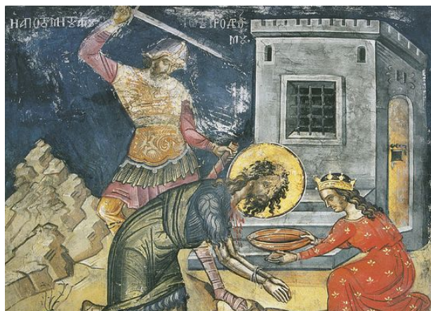
"16 век, Греция. Афон, монастырь Дионисиат

In commemoration of the beheading of St. John the Baptist Church established a holiday and strict fasting as an expression of the sorrow of Christians about the violent death of the great Prophet.